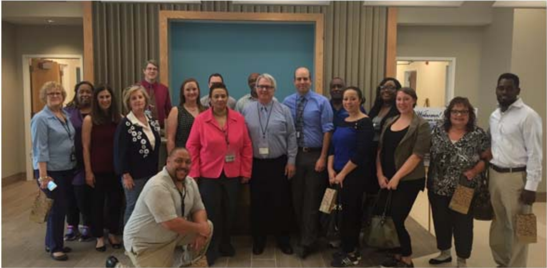
Thursday, April 20 Various Locations throughout the City of St. Louis